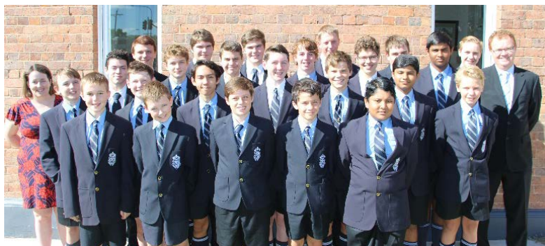
2017 St Mary’s College Debaters

Best wishes to our College debaters who will compete each Wednesday evening throughout the course of Terms 1-3. Boys involved are pictured below. Good luck for an enjoyable and successful 2017 Debating season.